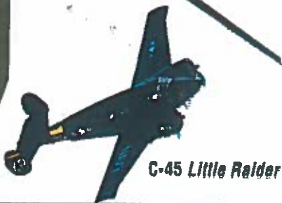
C-45 Little Raider