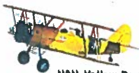
N3N Yellow Peril