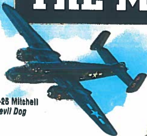
B-25 Mitchell Devil Dog